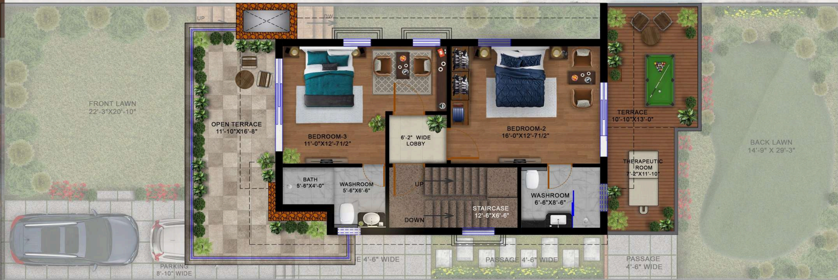
3 BHK VILLA